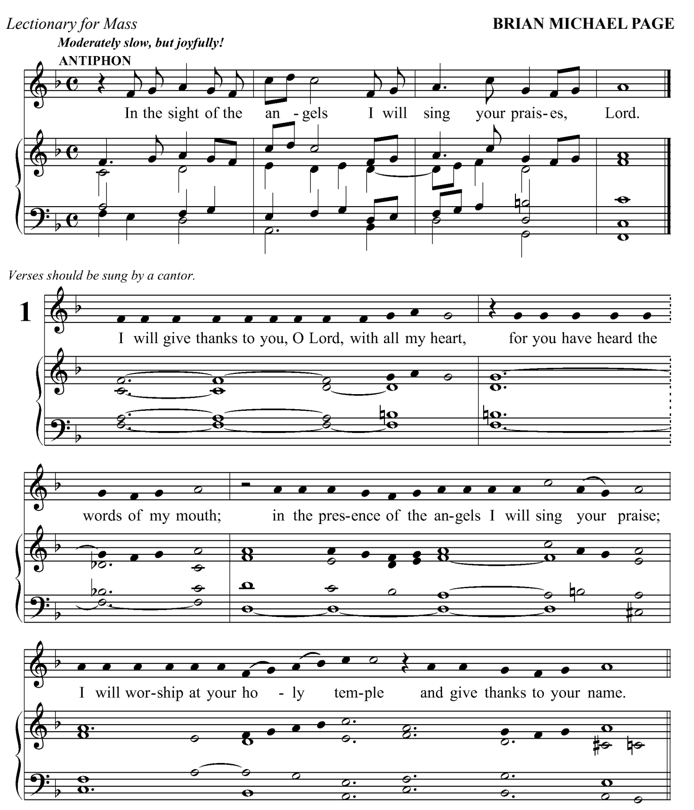
Text copyright © 1969 ICEL. All rights reserved. Used by permission. Music copyright © 2010 Christus Vincit Music. All rights reserved.